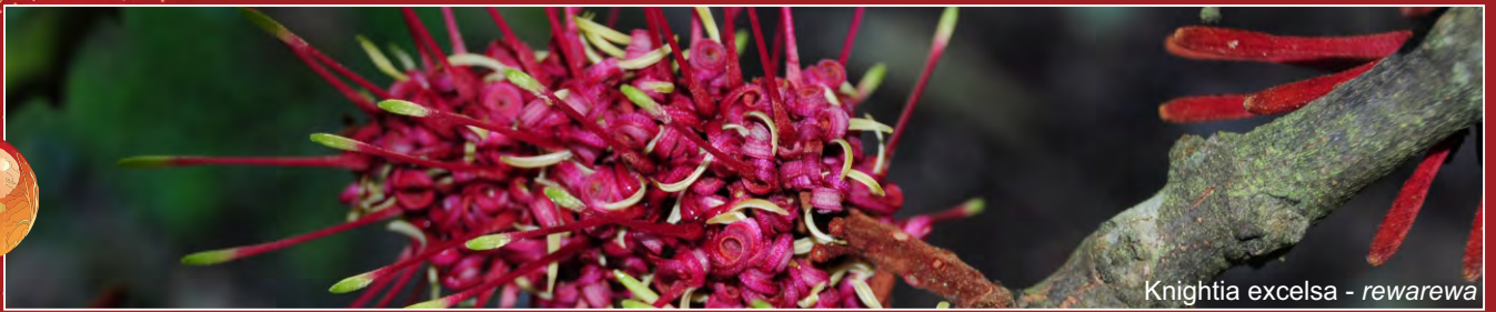
Knightia excelsa - rewarewa